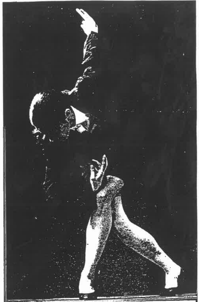
LAURENCE LEMIEUX IN CROSSWALK