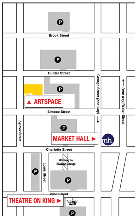
Cover: Vincent S.K. Manisoe in Skwatta.-Brochure: big sky design