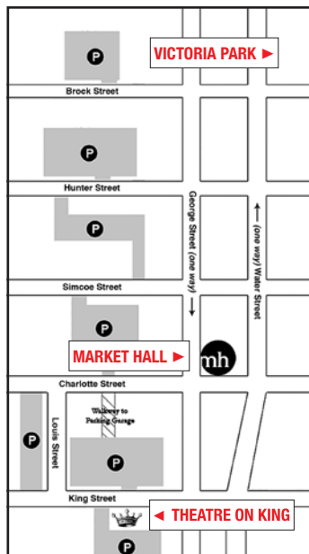
Cover: Peter Troszmer in EESTI: Myths and Machines. Brochure: big sky design