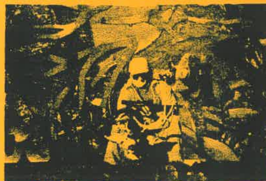
Tangled Web, detail, 1990, collage on panel