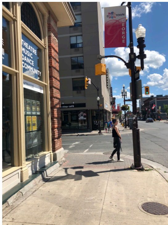
#6. Once you get to Charlotte Street, turn left.