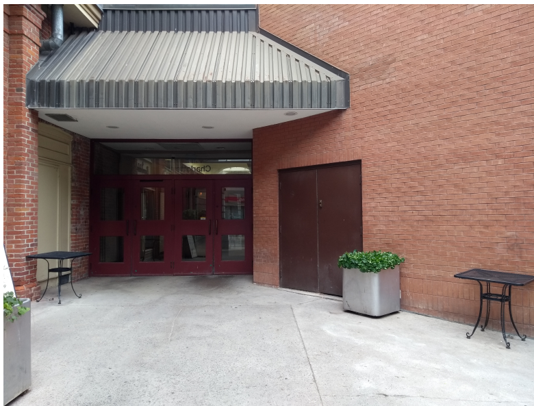
There is an accessible entrance to PTBO Square Mall past The Market Hall entrance and to the left of the first accessible courtyard entrance pictured on page 9.