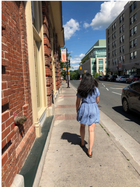
#5. Walk straight.