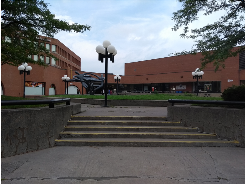
This is one of the entrances with stairs on Charlotte Street.