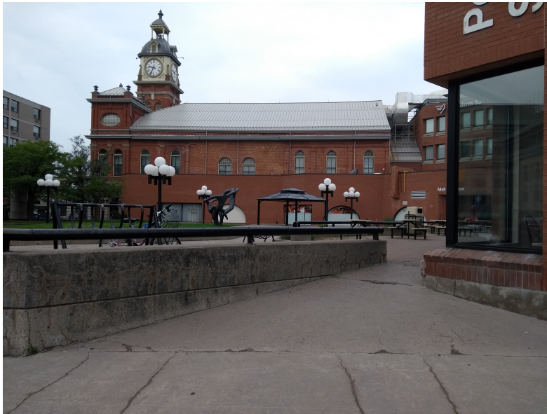
This is a second accessible entrance on Water Street.