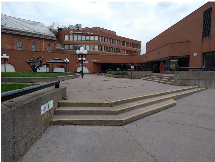
This is another entrance with stairs on Water Street.