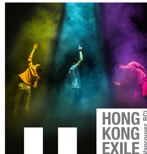
HONG KONG EXILE (Vancouver, BC)

FINAL PERFORMANCE: October 19 & 20, 2017 at 6:00pm, Brock Street Parking Lot, Peterborough