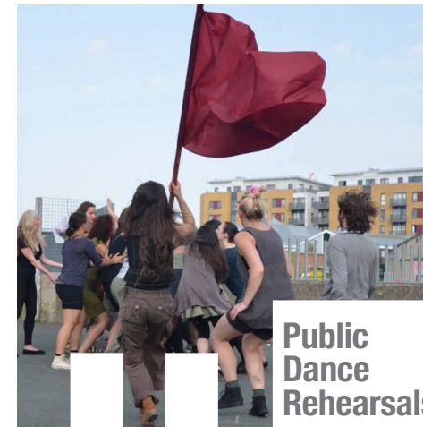
Public Dance Rehearsals