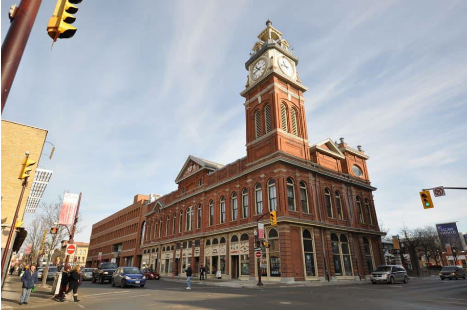
The Market Hall viewed from George Street by day