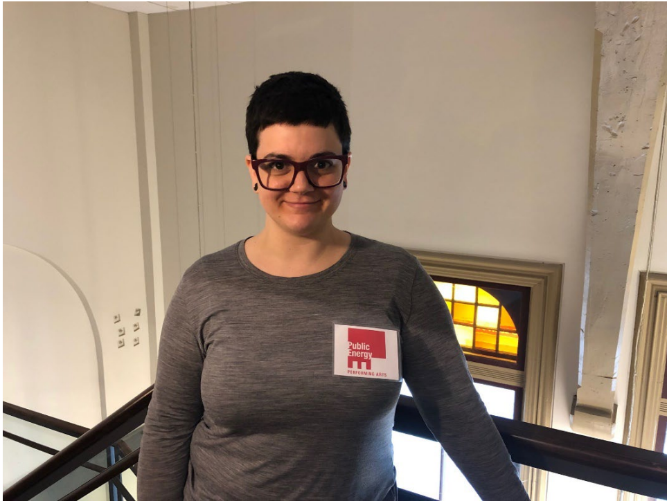
Photo of a Public Energy staff member wearing a badge

Public Energy Performing Arts staff and volunteers will be in the lobby prior to the show. You can recognize us by our badges, which have the Public Energy logo on them. You can ask us for assistance before, during or after a show. We will be happy to help.