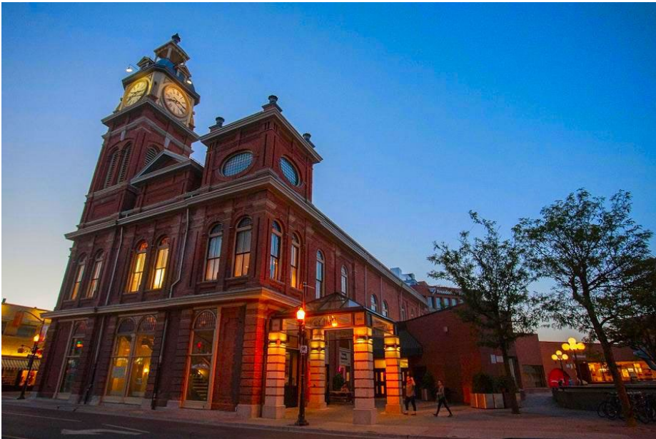
The Market Hall viewed from Charlotte Street in the evening.